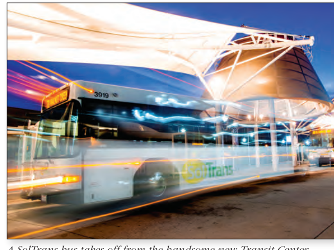
A SolTrans bus takes off from the handsome new Transit Center in downtown Vallejo. The move to merge and streamline transit in Solano County has drawn more riders while improving safety.

the phrase "Transportation for Transformation."