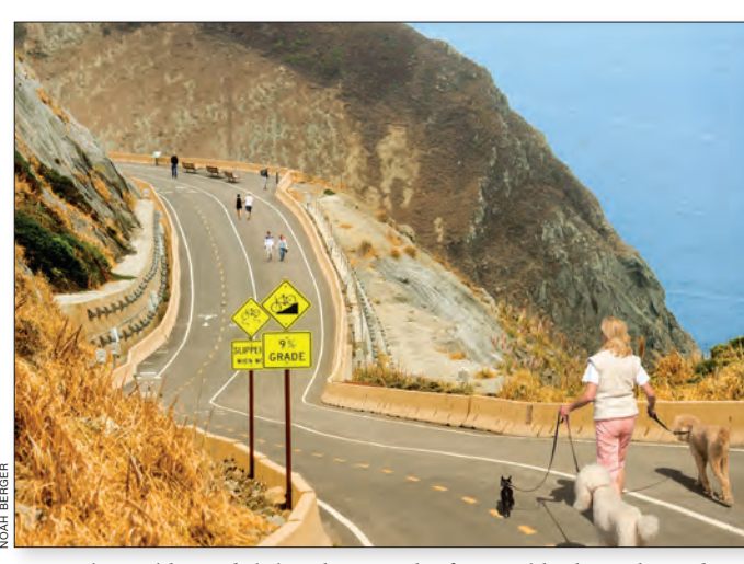
Once plagued by rockslides, this stretch of coastal highway has taken on a new life as a popular path for walkers, joggers and cyclists.

With its frequent rockslides and road closures, the old Devil's Slide that hugged 1.3 miles of the San Mateo County coastline was indeed hellish. Now the pair of inland replacement tunnels that opened in March 2013 safely usher cars through the mountains and past the once notorious segment of Route 1 between Pacifica and Montara. And just one year after the tunnels' debut, the